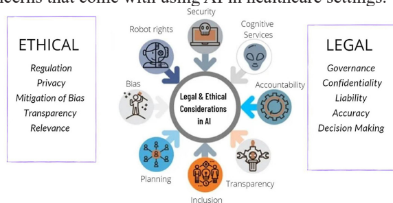
Figure 2. Various ethical and legal conundrums involved with the usage of artificial intelligence in healthcare [25]

The Resolution of the European Parliament was based on research that was paid for, supervised, and published by the policy department for “Citizens’ Rights and Constitutional Affairs” in response to a request from the Committee on Legal Affairs of the European Parliament. The report stresses how important it is to pass a resolution right away that calls for the creation of a law to govern robots and AI that can predict and adapt to any scientific breakthroughs expected in the next few years [26]. Figure 2 shows the different ethical and legal concerns that come with using AI in healthcare settings.